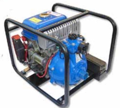
The electric start, Yamaha powered Universal Fire Fighter Pump

Give Andrew Barnes a call on +61 8 9249 7599 to take up this offer.